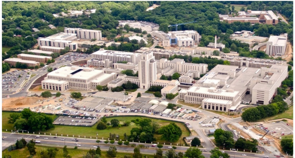
Walter Reed National Military Medical Center

CliniComp's Critical Care solution installed. Customer since 2017.