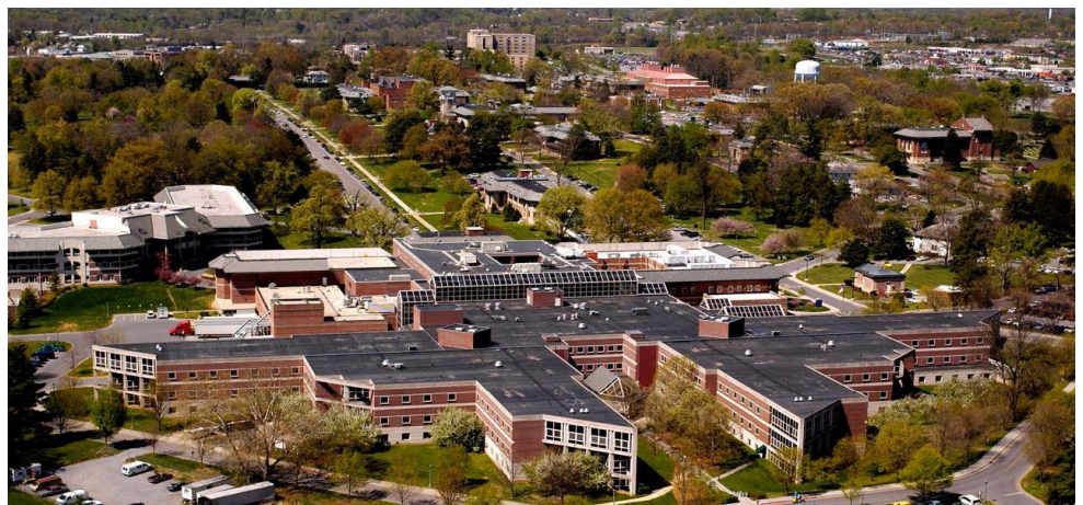
James H. Quillen VA Medical Center

The medical center currently uses UDAS to capture data from fetal monitors, incubators, ventilators, physiological and cardiac output monitors and other connectable bedside devices in labor and delivery (L&D), the neonatal intensive care unit (NICU), and the intensive care unit (ICU).